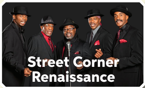
Street Corner Renaissance

Backtrack Vocals is a 5-person a cappella singing group that transforms familiar pop, funk, Motown, standards, and Broadway songs with all-new vocal (and beatbox) arrangements.